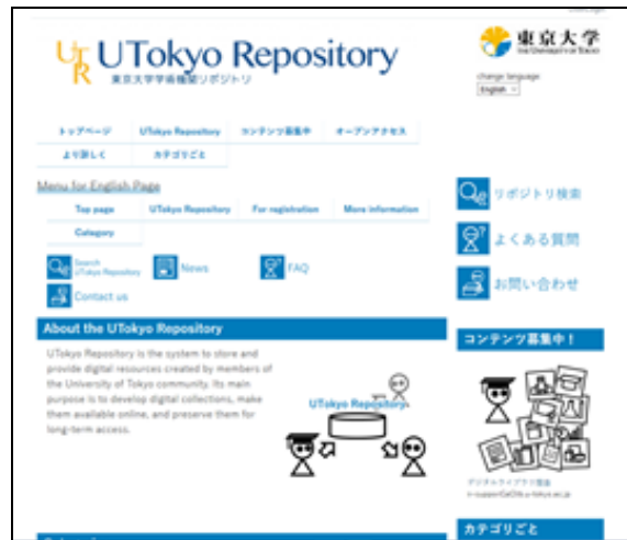
Top page of UTokyo Repository

( https://repository.dl.itc.u-tokyo.ac.jp/?lang=english )